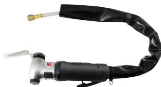
Oscillating knife kit (wind shield cutter) EG308