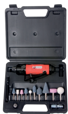
Mini die grinder kit 15pc EG120K-19R