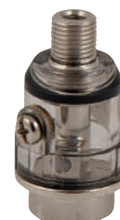
Mini oiler /Lubricator