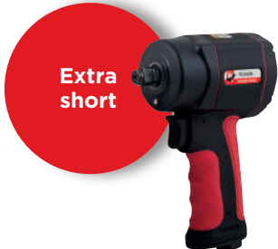
1/2" Angle impact wrench EG558