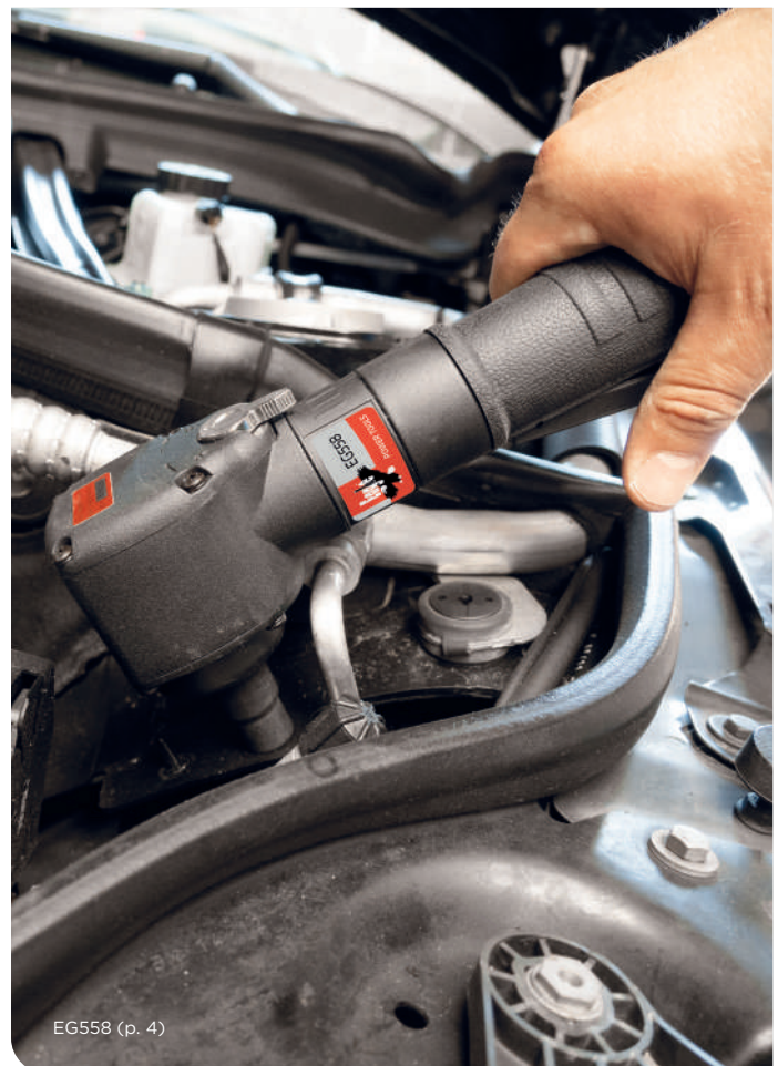
EG558 (p. 4)