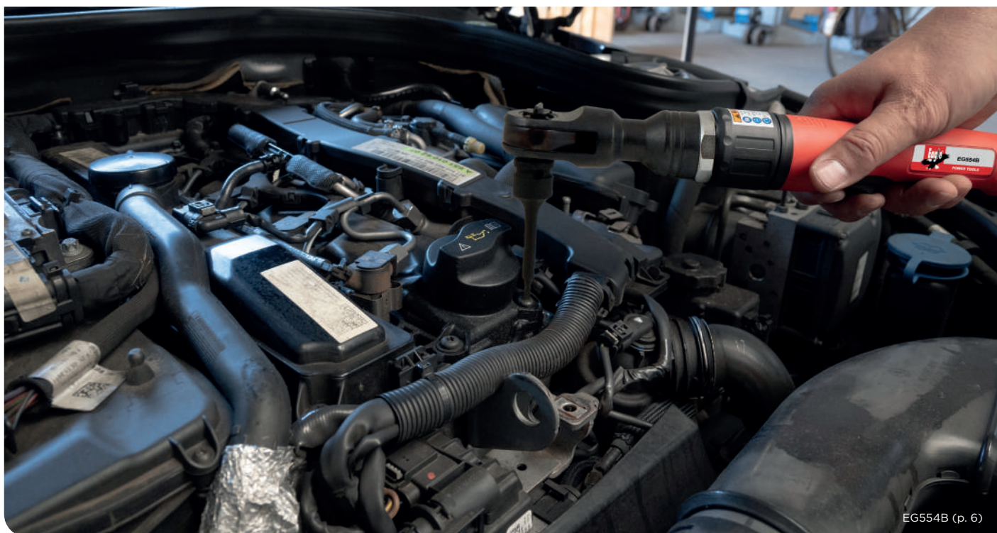
EG554B (p. 6)