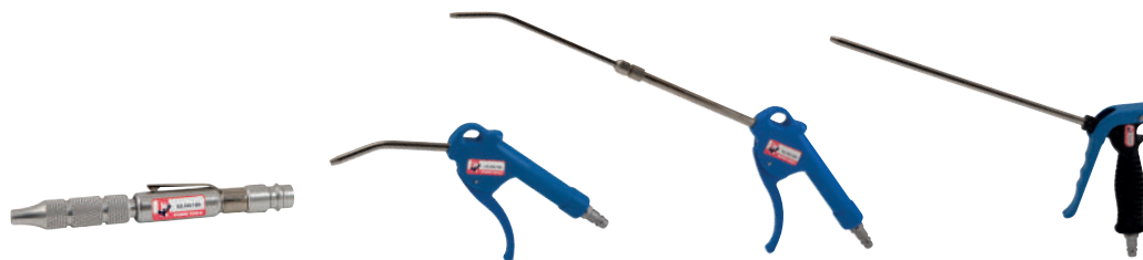
Pocket blowgun EG001B71S