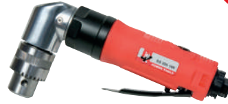
90° Angle drill 10 mm EG225-19R