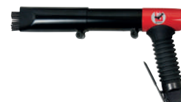
Smart Eraser EG260S-19R