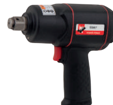
1/2" Impact wrench EG1460A