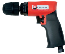
Reversible drill 10 mm EG213-19R