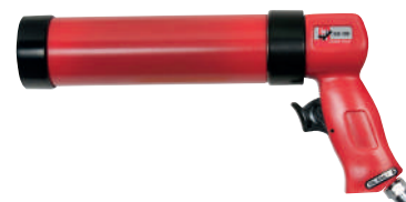
Caulking gun EG195