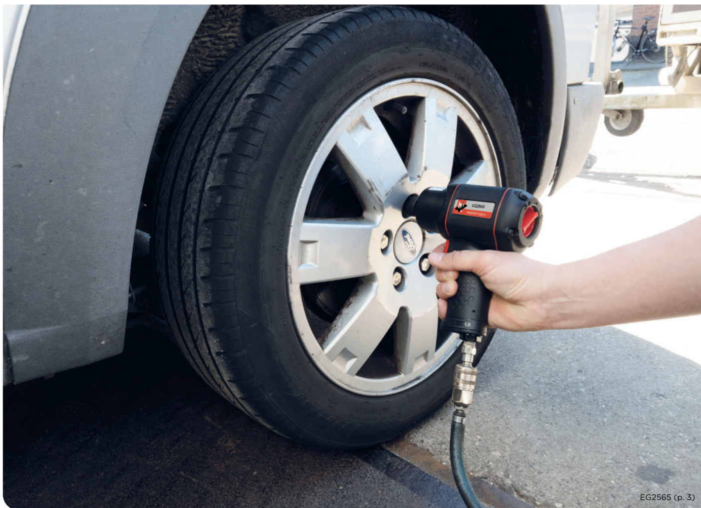
EG2565 (p. 3)