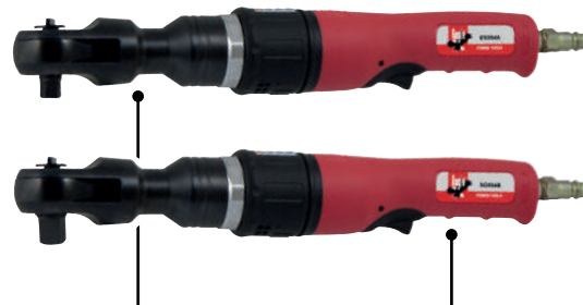
3/8" reactionless ratchet EG554A