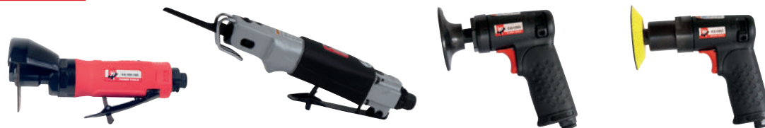
75 mm Cut-off tool EG250-19R