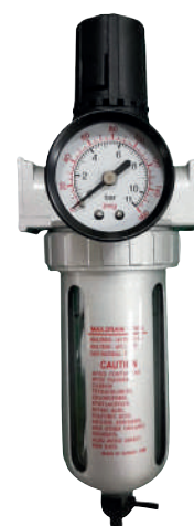
Air pressure filter-reducer with manometer, Oil lubricator EG001894