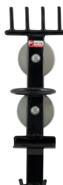
Magnetic tool holder EG119M