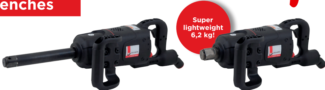
Heavy duty 1" impact wrench EG1663C