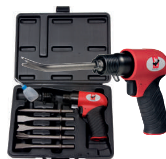
Hammer kit EG-01-06-0012