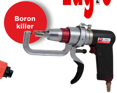
Spot weld drill, Boron killer, uses tungsten carbide drills EG327HN